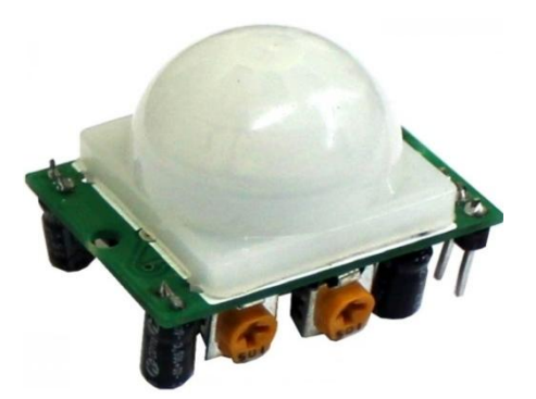
Figure-3 Pyroelectric Infrared Sensor (PIR)

A passive infrared sensor (PIR sensor) is an electronic sensor that measures infrared (IR) light radiating from objects in its field of view. They are most often used in PIR-based motion detectors. All objects with а temperature above absolute zero emit heat energy in the form of radiation.