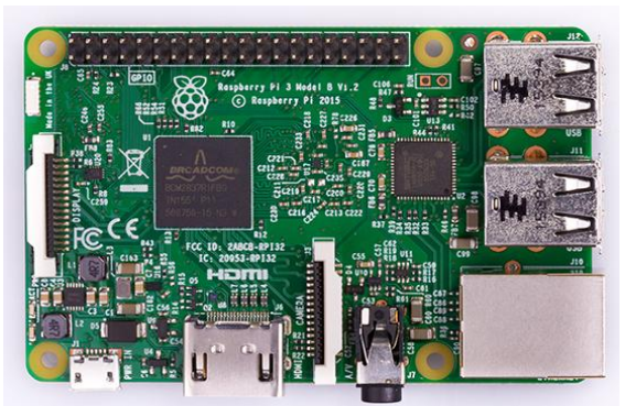
Figure-2 Raspberry Pi-3

In this project the Raspberry Pi-3 is the main component through which we can control and monitor the lightning devices. We are used this processor because it is having different features like performance and cost. It is also a high speed processor.